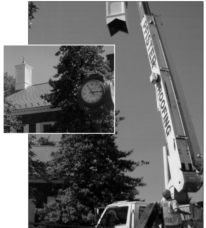
Pfister installing marquee item, a 14-foot, all fiber glass cupola replacing the original one

In 2009, we were given the privilege to be a part of another renovation/restoration project on the library. Our part of the restoration included the installation of a new slate roof, new copper built-in gutter, copper cladding of existing masonry copings, new flat roof, the complete restoration of all the ornate millwork corner cornices and the installation of a new cupola.